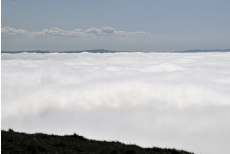
Figure 2: Advection fog completely obscures Cardigan Bay, off the west coast of Wales, on an April afternoon in 2015, Air warmed over the land was advected seawards, where its moisture promptly condensed over the much colder sea surface.