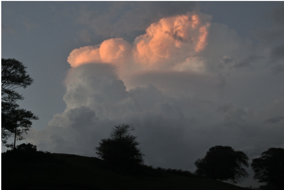
Figure 1: Severe thunderstorm developing over the Welsh countryside one evening in August 2020. This excellent example of convection had stroonal Meteorological Office. As a “test case”, the Review did obtain data directly from the Japanese NMO.

The Review makes the following criticism of CRU: