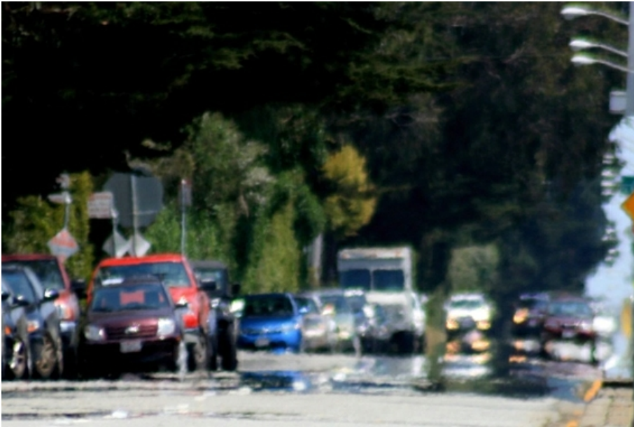
Figure 3: Heat haze above a warmed road-surface, Lincoln Way in San Francisco, California. May 2007.